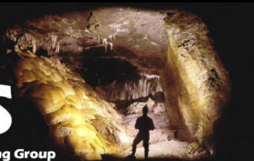
Departure Lounge, Upper Flood (by Charlie Allison)