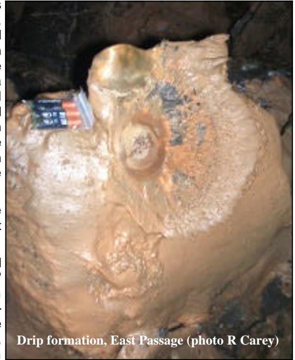
Drip formation, East Passage

Sonya Cotter and Gary Jones inspected the Neverland and East Passage sumps on 20/01/07. The East passage 'sump' turned out to be a grotty pool with no going holes. The sump in Neverland is a real sump, and progress has not been completely ruled out, but it's certainly not going to be an easy free dive to more passage! Gary found several rifts pinched-off bits, one with a really tight gap in the roof. Further investigation with