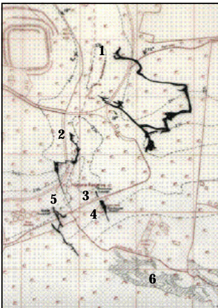
Caves of Blackmoor Valley

"Only a slender stream of water trickles down the Blackmoor Valley, and before it has travelled far a series of swallets reduces its volume still further, until by the time it reaches the Priddy road it has completely disappeared." (Gough, 1967).