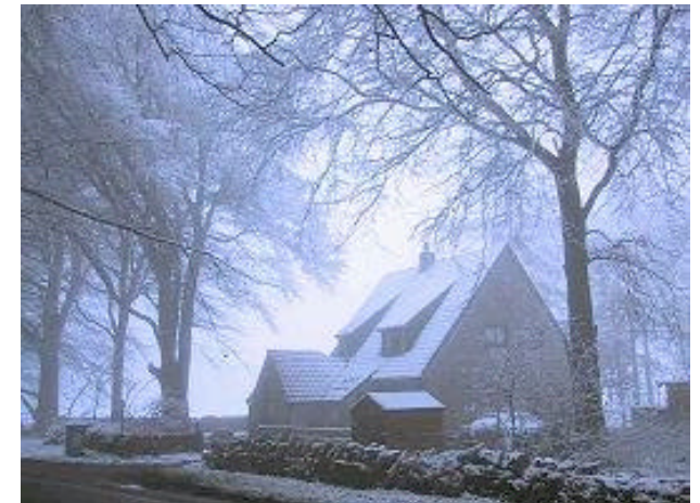
Headquarters of the Mendip Caving Group