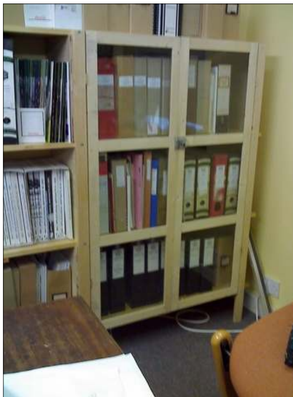
A new cabinet for the log books

Redcliffe Caves Guide published by Axbridge Caving Group in 1996. Six page pamphlet about the "caves" which are in the centre of Bristol. Visits can be arranged via Alan Gray of Axbridge Caving Group (donated).