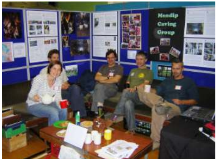
The MCG stand was a mock up of the cottage lounge

www.mendipcavinggroup.org.uk/documents/HE09.pdf