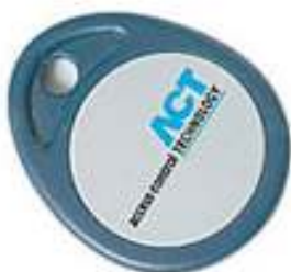
Key fob (actual size)