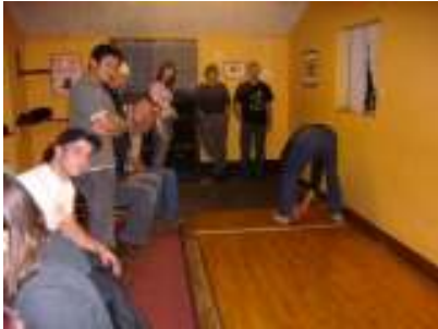
Free style bowling at the New Inn