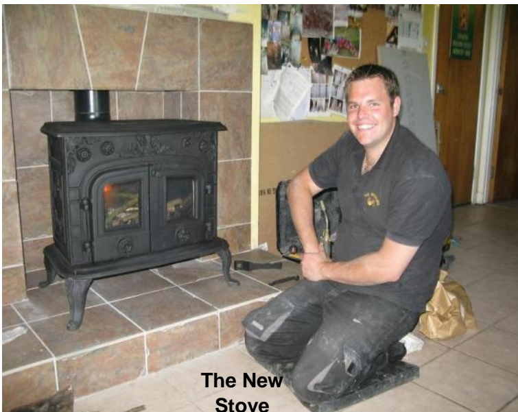
The New Stove